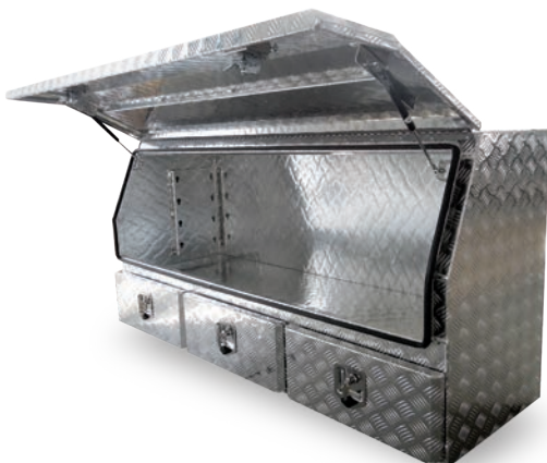
FULL DOOR 3D

WEIGHT 68.5kg WIDTH 600mm HEIGHT 850mm LENGTH 1425mm