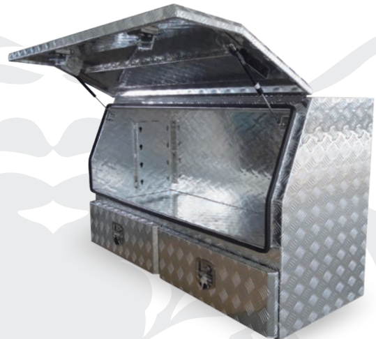
FULL DOOR 2D